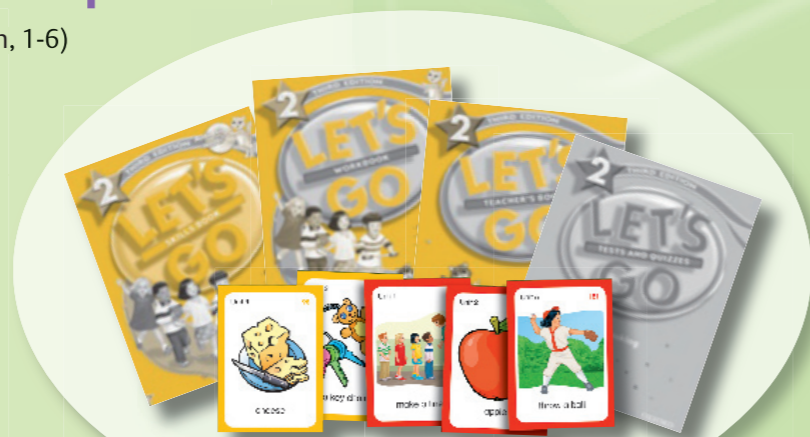
Let's Go Third Edition Components