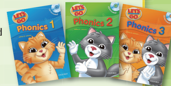
각 권마다 오디오 CD 부착 Each level includes a CD